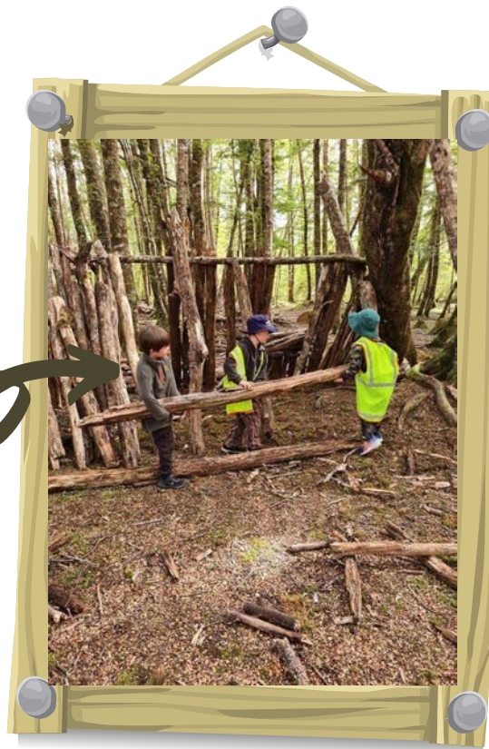
The Te Anau school juniors enjoying the outdoors at Borland