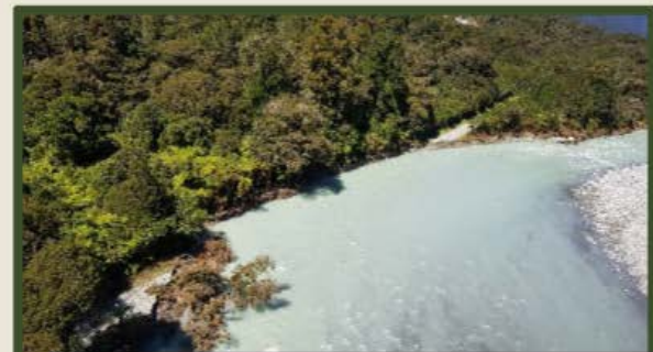
Photo 8: Physics 101: water taking the path of least resistance.

Continue to obey all notices and signs, watch for the heavy road works machinery, and follow instructions