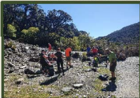
Photo 7: The program team mingle with trampers at a busy Lake Howden.

Howden, namely a day shelter and toilets. Some potentially suitable locations for the facilities have been identified. Stay tuned as we work through the various requirements.