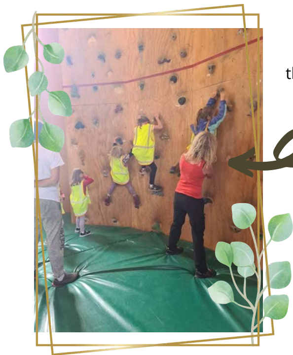
The juniors at Te Anau school having fun learning to use the climbing wall in March

Check out these recent images that have been shared on Facebook of some of our local community enjoying their stays at Borland. To book your next adventure please visit https://www.borlandlodge.co.nz/