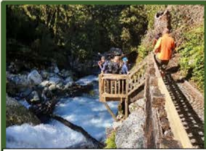
Photo 6: Management by walkabout at Lake Marian Falls.

The program governance group, along with senior DOC and program managers, project team members and various technical personnel visited Fiordland throughout March. They visited the flood-affected sites on the Milford Road and everyone got a comprehensive “on the ground” feel for the completed work as well as the planned works.